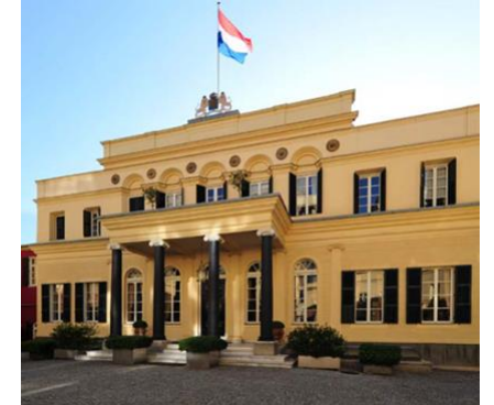
Palais de Hollande, Istanbul